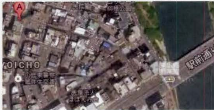
(in vicinity of shown location)

Spice Ecstasy, 4-4 Nagarekawa, Naka-ku, Hiroshima City, Japan