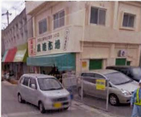
(in vicinity of shown location)

Soft Cream (and distribution service "Lequio Herb"), 1-15-8, Okinawa City, Okinawa, Japan