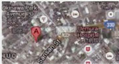
(in vicinity of shown location)

Jah Reggae Shop, 1-6-20, Chuo, Okinawa City, Japan