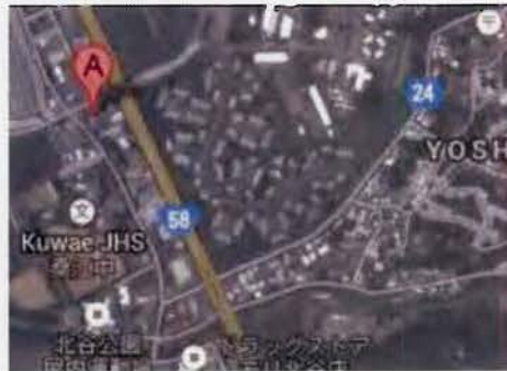
Heaven's Smell (Formerly Samurai King), 1-8-1 Chuo, Okinawa City, Okinawa, Japan