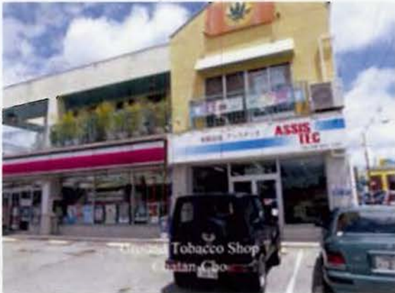
Ground Tobacco Shop, 2F 1-5-9 Mihama, Chatan Cho, Okinawa, Japan