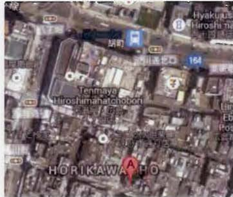
(in vicinity of shown location)

Joint, 3-22 Yayoi i-cho, Naka-ku, Hiroshima City, Japan