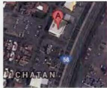
Yoshihara Red Light District. In the Yoshihara Red Light District, establishments with a storefront that faces 329 or 330 are not off-limits.