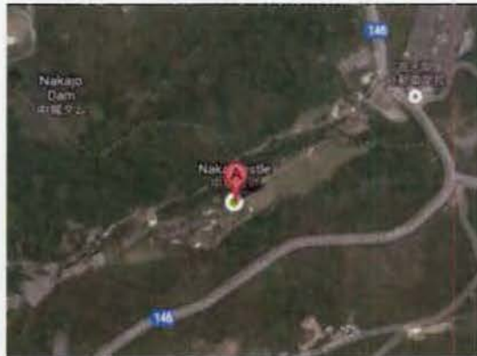
(adjacent castle depicted on map)