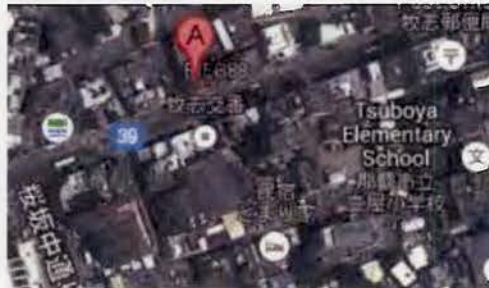
Fantasy Space Okinawa, 2 Chome 17-46 Makishi, Naha