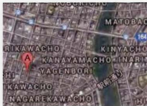
(in vicinity of shown location)