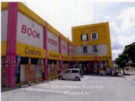
Tokyo Syoten Bookstore, Highway 23 at 820-6 Kamisedo, Chatan-Cho, Okinawa, Japan