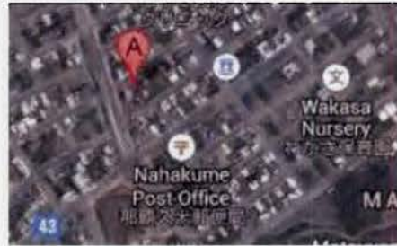
(in vicinity of shown location)

High Times, 1-6-2 Chou, Okinawa City, Okinawa, Japan