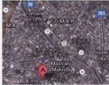
Takahara Hotel, adjacent to the Nakagusuku Castle in Ishado Nakagusuku Village, Okinawa, Japan. See below maps.