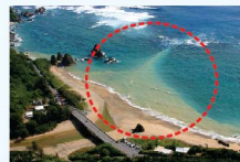
Iegawa Estuary (Kunigami Village)