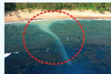
Oku Fishing Port South (Kunigami Village)